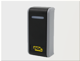
PAC GS3-LF Mullion

PAC's Oneprox™ reader range is ideal for use with Easikey 250. Easikey 250 is backward compatible with Easikey 99 and will support existing PAC readers.