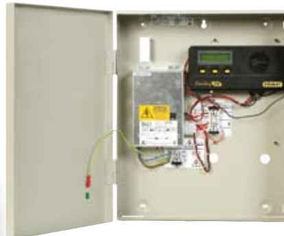
Easikey 250 boxed