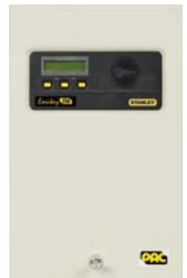
Easikey 250 boxed with cut-out