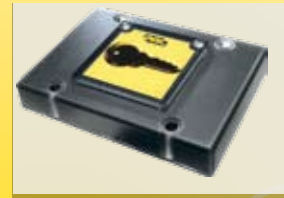
PAC GS3-LF Panel