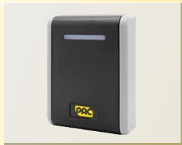
PAC GS3-LF Standard