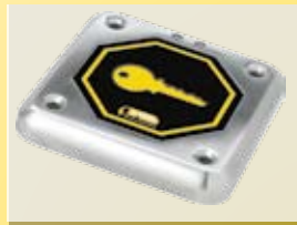
PAC GS3-LF Vandal